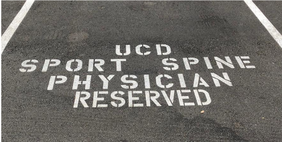
F4a. Example of a Physician marked spot