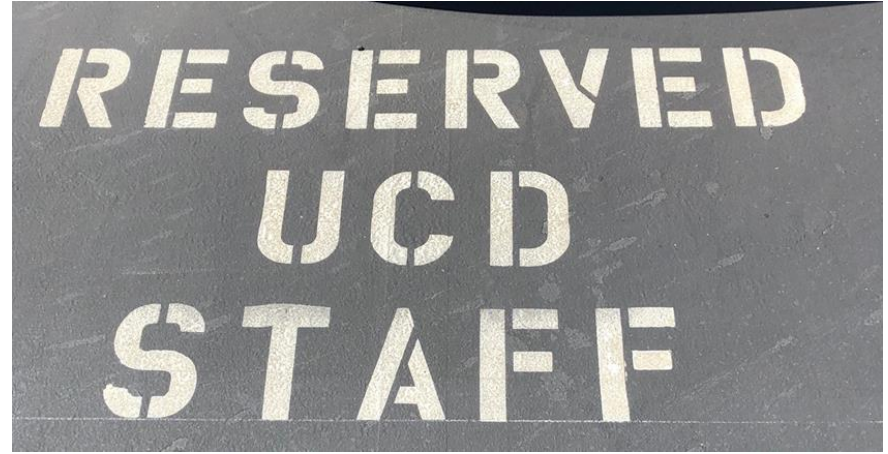
F4b. Example of a UCD Staff marked spot

Figure 4 contains two photos of marked parking spots at the C Street location. The pictures show examples of both a physician marked spot as well as a staff marked spot. When referencing the different types of marked parking spots in my proposal, this visual will be used so that audience members who are not familiar with the C Street location will be able to visualize what the marked parking spots look like.