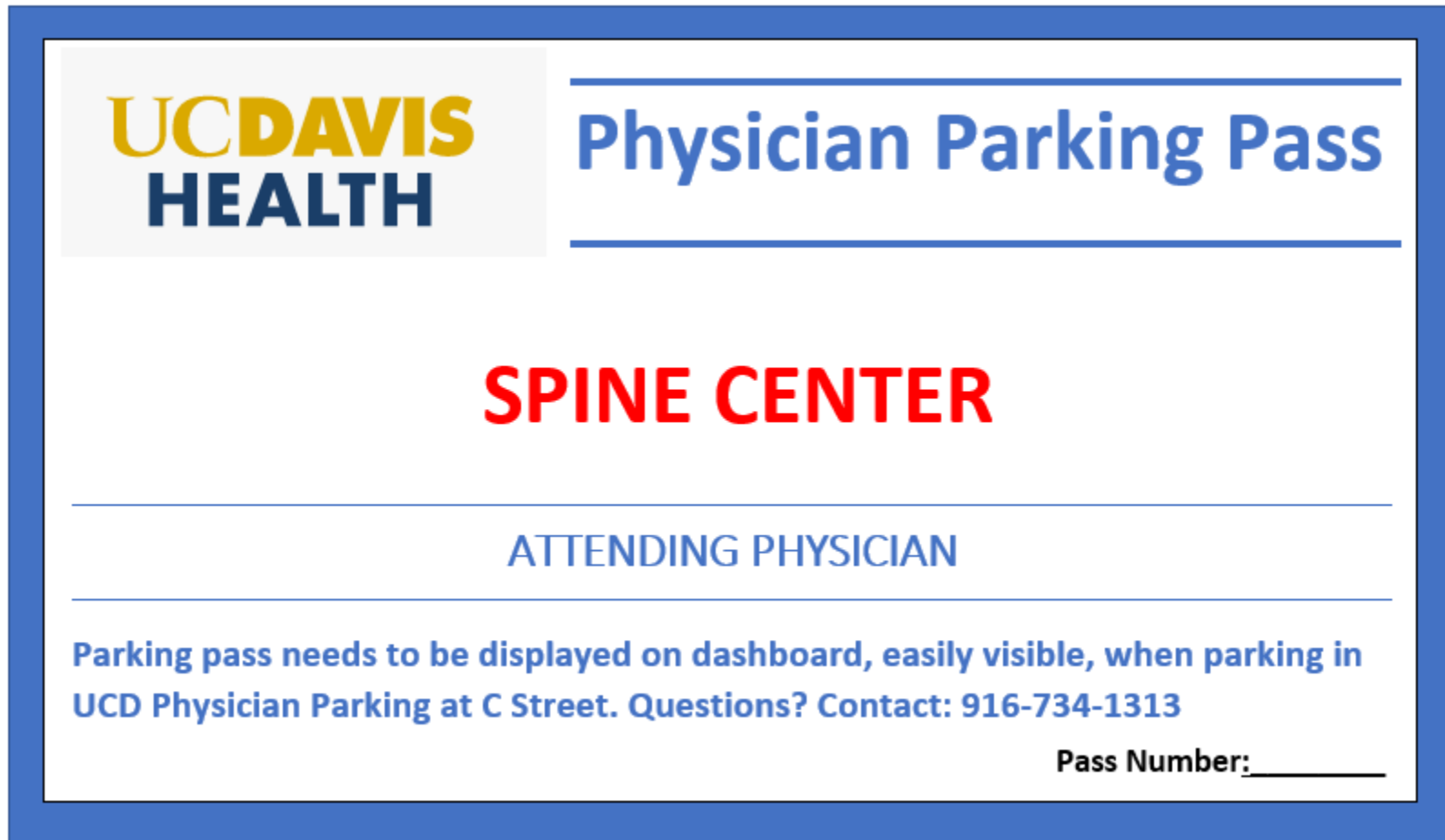
Figure 2. Sample UCD C Street Physician Parking Pass

An issue regarding C Street parking is employees, residents and fellows parking in physician parking spots. Part of my proposal will include ways to ensure physician parking on C Street is only used by our attending physicians. Figure 2 will be used when I discuss the physician parking issue and will support my proposal for all attending physicians, who would like to park in a physician assigned parking spot, be issued and use their assigned parking pass. This will help management identify cars parked in unauthorized parking spots.